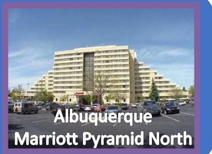
Albuquerque Marriott Pyramid North

http://web2.acbl.org/tournaments/results/2018/01/1801024.htm#1